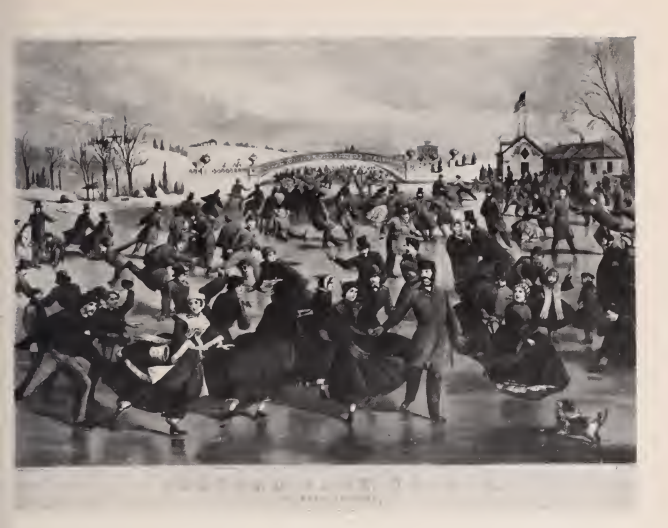
VERY SCARCE PRINT OF CENTRAL PARK, NEW YORK, IN 1862 [NUMBER 53]